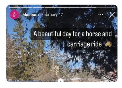
Instagram Story Updates