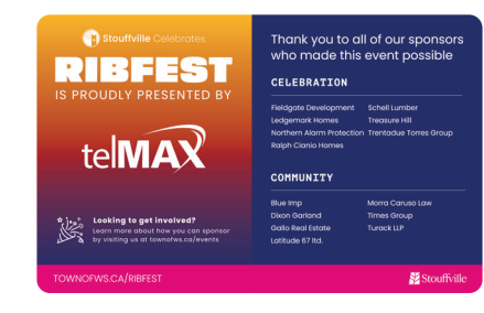
Sponsor Thank You Signage