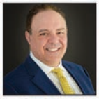
JOE GALLO *