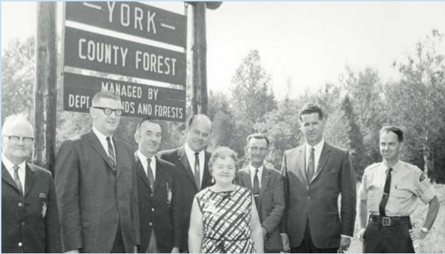
ABOVE: York County Council members during the annual tour and inspection of the Vivian Forest, 1968.

York Region has organized monthly guided forest walks with forestry experts to mark this special occasion, creating an adventure challenge to explore different forest tracts, capture your favourite forest moments in a photo contest, or help restore the natural environment through community tree planting events.