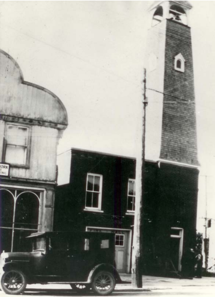
ABOVE: This Stouffville landmark has been home to a fire hall, council chambers, and even a jail in its more than 100 years of history.