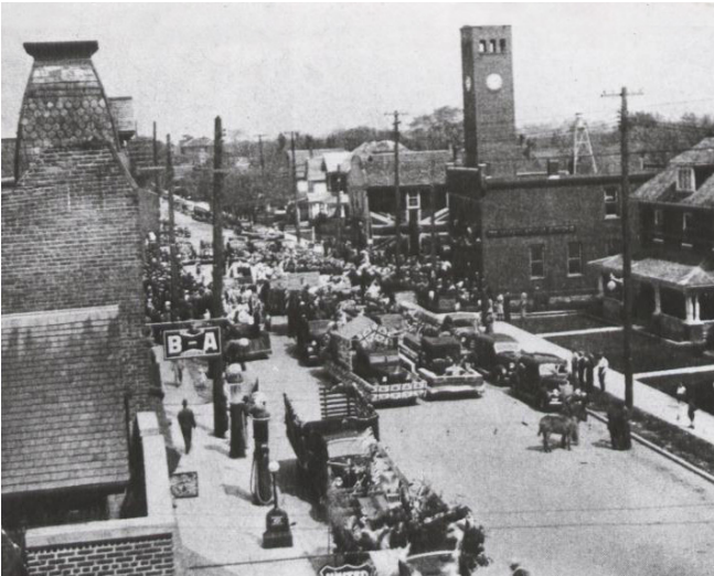
ABOVE: View of Main St. with the clock tower on Dominion Day in 1938.