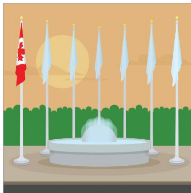
In a semi-circle (Leftmost position as viewed from the main approach)