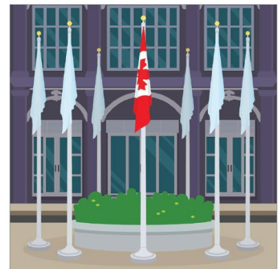
In a full-circle (Central position as viewed from the main approach)